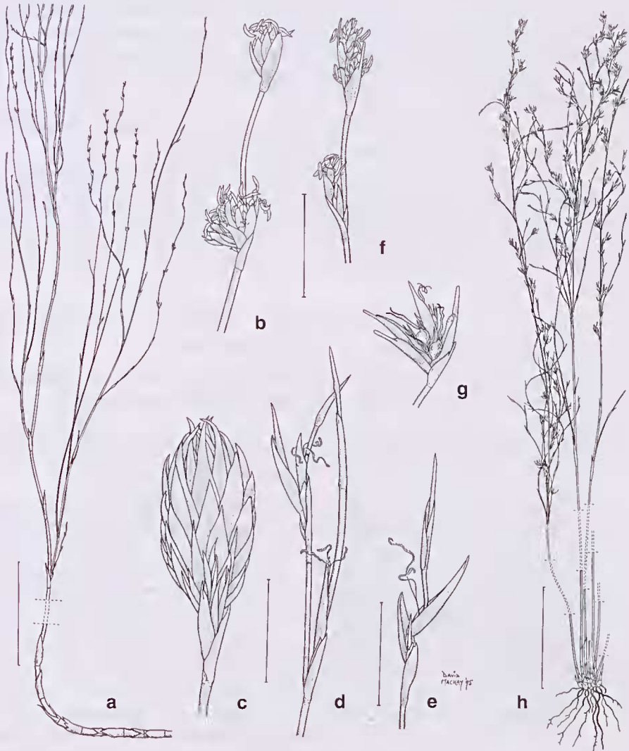
Fig. 6. a-e, Taraxis grossa , a-b, male: a, habit. b, spikelets ( Briggs 9074 ). c-e, female: c, gall. d, e, spikelets (varying in number of style-branches) ( Briggs 9075 ). f-h, Tyrbastes glaucescens , f, male spikelets ( Briggs 8337 ). g, h, female: g, spikelet ( Briggs 9056 ). h, habit, ( Briggs 8645 ). Scale bars: a, h = 10 cm; b-g = 1 cm.

A Taraxis combinatione characterum sequentium distinguitur: plantae caespitosae, basibus pubescentes; spiculae femineae floribus 1 usque ad pluribus, tepalis 6, loculis 2 vel 3; chlorenchyma costis sclerenchymatis et cellulis epidermalibus dilatatis interruptum, sine cellulis columnaribus.